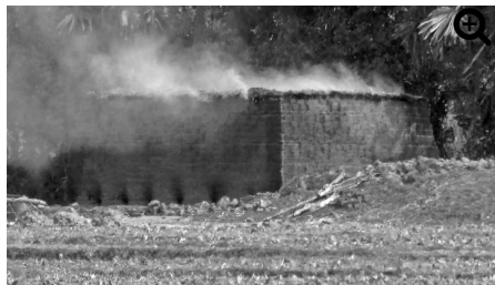
Brick kilns in Cuutack

CUTTACK: With mercury hovering above 40 degree Celsius, mushrooming of illegal brick kilns have added to the heat misery in Cuttack district. Environmentalists have opined that these brick kilns are responsible for rise in temperature in the region as well as land degradation and air pollution. Moreover, the district administration has failed to curb the menace, leaving the residents fuming.